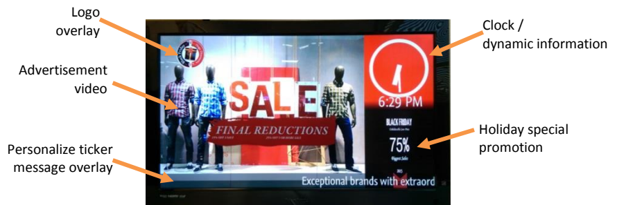
Retail advertisement demo (Monitor not included)